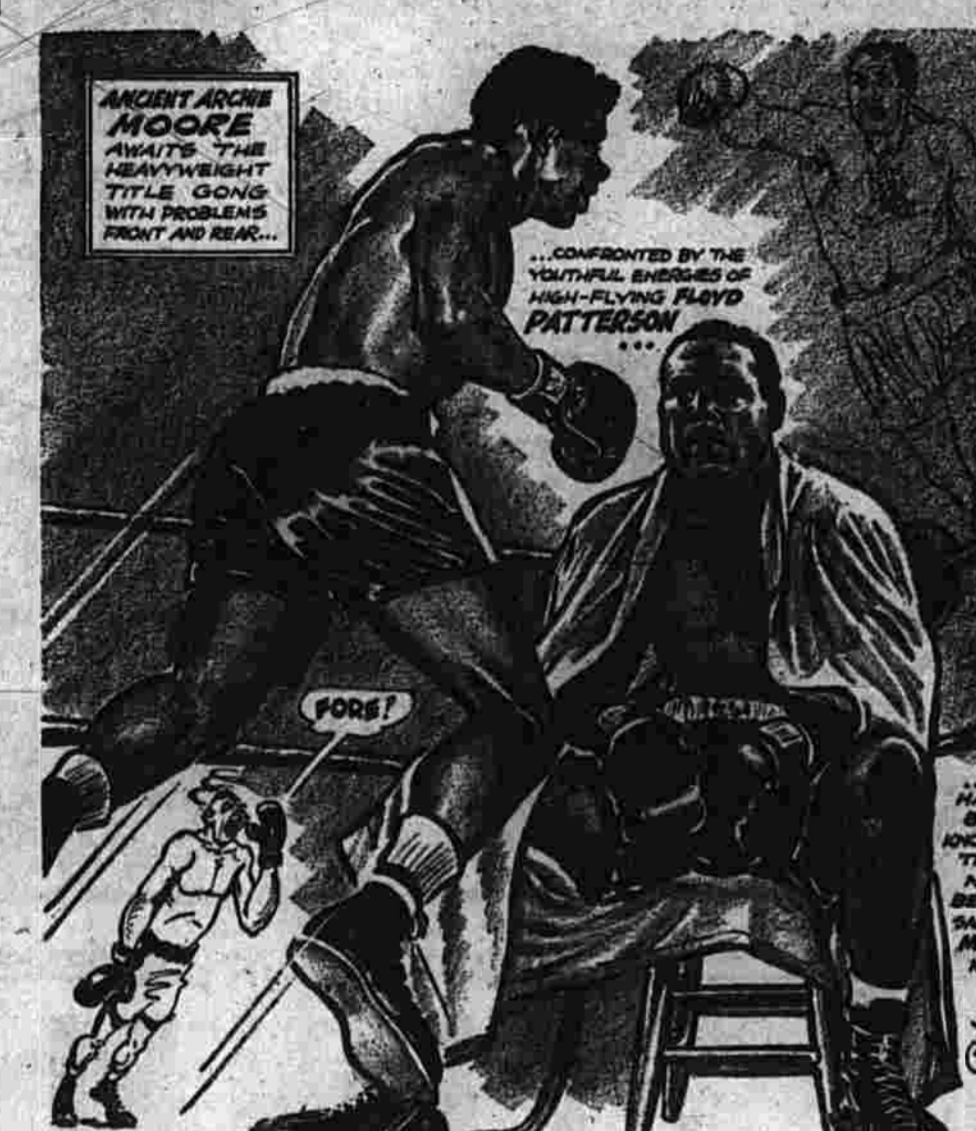
ARCHIE MOORE HAS THIS HEAVYWEIGHT TITLE GOING BOTH FRONT AND REAR...

Chicago, Nov. 29.—For the third time in modern ring history, a vacated world heavyweight title is up for grabs at the Chicago Stadium tonight in a showdown between two top contenders, 39-year-old Archie Moore and 21-year-old Floyd Patterson. They battle for Rocky Marciano's abdicated crown.